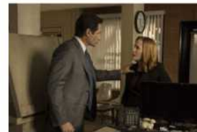
Review: 'The X-Files' Season 10 Episode 3, 'Mulder and Scully Meet The Were-monster' Is A Treat to Be Treasured