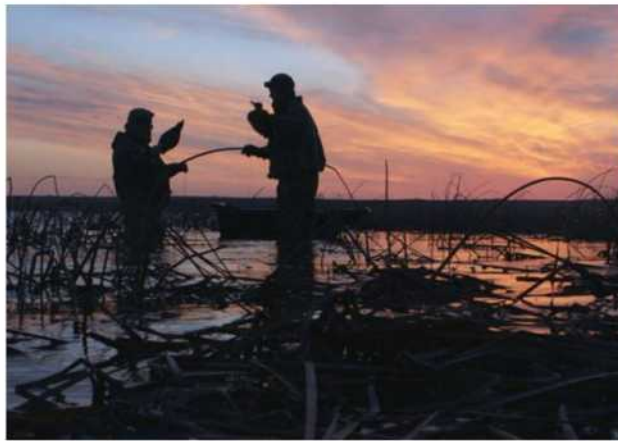
"Million Dollar Duck"