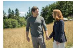
The Entire Planet is Watching 'The X-Files' Revival, and That's Terrible News for TV