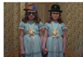
Watch: Short Film Sensation 'The Chickening' is an Insane and Genius Stanley Kubrick Remix