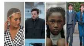
The 12 Major Breakouts of the 2016 Sundance Film Festival