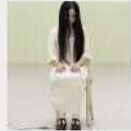
The Terrifying Girl From 'The Ring' Grew Up To Be Gorgeous