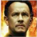
10 Sequels You Didn't Know Were Coming In 2016