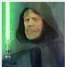
The Original 'Star Wars 7' Script Used Luke Very Differently