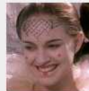
Natalie Portman Thinks 'Star Wars' Ruined Her Career