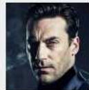
5 Potential Blockbusters Marvel Is Banned From Making