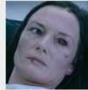
8 Movies That Suddenly Turn Terrible After 20 Minutes