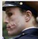
The Theory That Makes Ledger's Joker Even More Epic