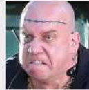
The Real Reason 'The Amazing Spider-Man 3' Got Canceled