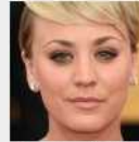
The Shady Side Of Kaley Cuoco 'You Don't Know About