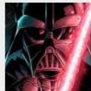
6 Most Messed Up Things In 'Star Wars' No One Ever Talks About