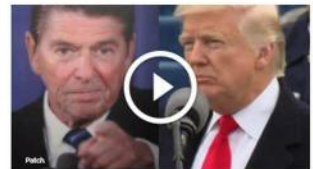
7 Things Trump Has Already Done As President