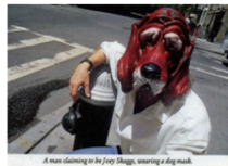
A man claiming to be Joey Skaggs, wearing a dog mask.

As an artist, satirist and activist, I am very fortunate that I live in America. My freedom is never taken for granted and I cherish my rights to criticize the misuse of power. I'm well aware of what happens to people who live in other countries where there is no tolerance for dissent. Not that this is a perfect country... If it were, I would be out of a career!