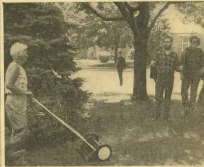
Hippies touring Queens yesterday chatting with one resident on 181st Street off Union Turnpike. They said the tour was to counter tourists making visits to St. Mark's Place.